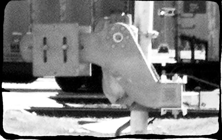
Photo taken while waiting for a freight train.

I see "creatures" everywhere I go. They're in plant shadows, sidewalk cracks, peeling paint, fire hydrants, building ornamentation, clouds, water marks, and trash... when you start looking you will suddenly see them everywhere, too!